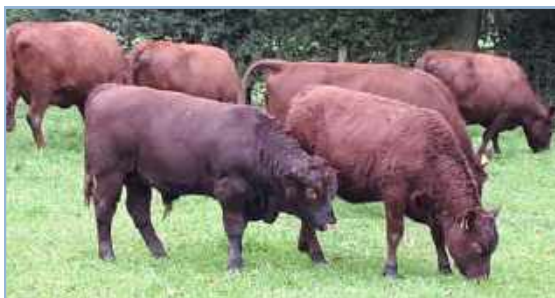
Below: Oaklands Herd