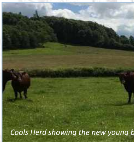
Cools Herd showing the new young b

Langley the proud owners of the Oaklands Herd both very passionate about Red Polls and their wonderful herd. A relatively new herd as the first cows only arrived in 2010. All the stock were in excellent condition, a very