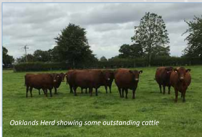
Oaklands Herd showing some outstanding cattle