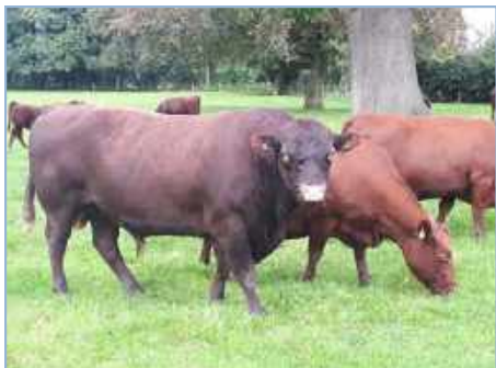
Above: Appleton Okavango