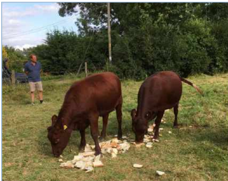
Stapleford Herd two young heifers having a slice of bread for dinner