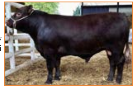
Junior Bull born on or after 1<sup>st</sup> January 2019 – 1<sup>st</sup> Hopeham Jabari