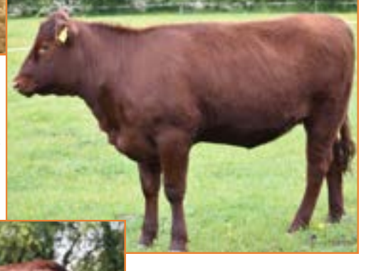
Maiden heifer born in 2018 – 1<sup>st</sup> Nobodys La Bise (5 entries)

Maiden heifer born on or after 1<sup>st</sup> January 2019 – 2<sup>nd</sup> Nobodys Mahina (8 entries)