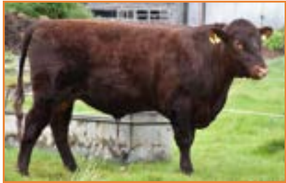
3<sup>rd</sup> Nobodys Merlin (4 entries)