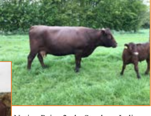
Native Pair - 2nd - Stonham India and Stonham Ivory