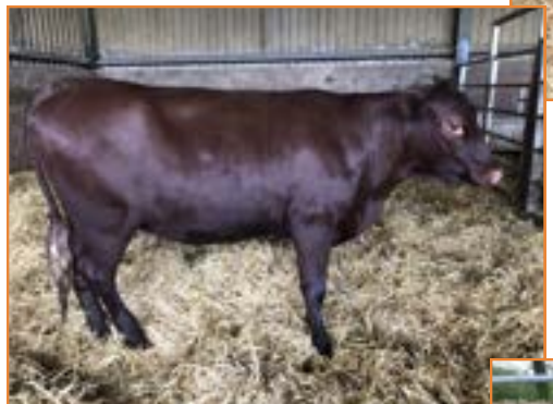
Native calf—1st Stonham Jacqueline

Native female born between 1/9/17 and 1/9/18—2nd Stonham Ivory