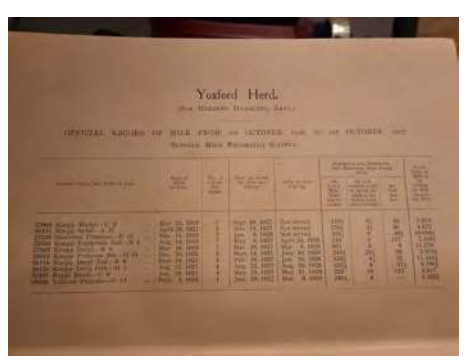
Mavis Milk at Yoxford