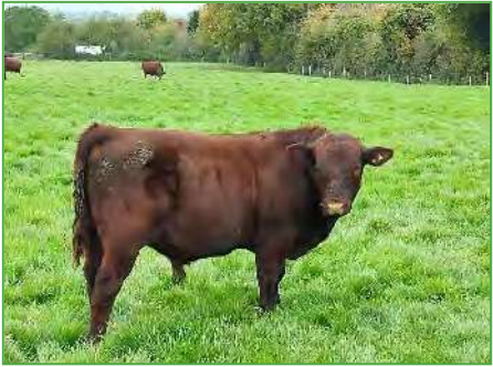
Chorlton Lane Crystal with twins