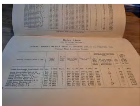
Mavis Milk 2 Butley