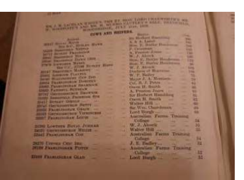
Mavis Sale to Hambling