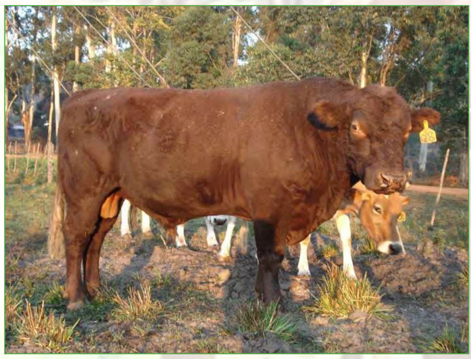
Homelime 08115 bred by Jimmy Brookes of Kenya and below first Red Poll cross calf born at Shiwa

The herd of Red Poll cattle was established in 2010 when the very enthusiastic Mark Taylor of Woragus Stud allowed us to have bull 08115 a pedigree bull from the famous Homelime Red Poll stud in Kenya (https://www.homalime.com). This bull's offspring crossed with Borans (East Africa Zebu) and the Jersey dairy herd impressed us so much that we offered 20 plus female stock, these animals become the basis for the Shiwa N'gandu Red Poll herd.