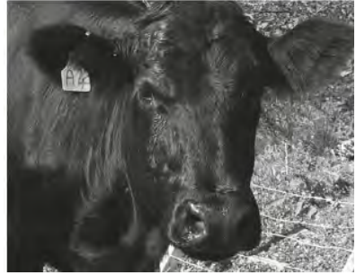
Sick cow caused by summer mastitis.

Summer mastitis is usually a disease of nonlactating cows and heifers during the summer months. It also occurs occasionally in the rudimentary udders of young heifers, bulls and steers. In beef cows, summer mastitis is often seen when barren spring calving cows are kept for later breeding (e.g. transferred from the spring herd to the autumn-calving herd on the farm). It is important to note that some beef cows may stop lactating before the calf has been removed from its dam. There is a wide regional variation in its incidence in the UK.