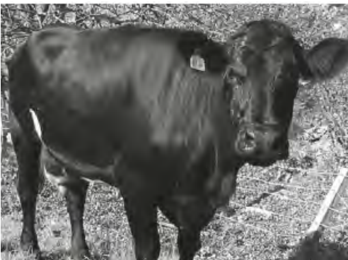
Sick cow caused by summer mastitis. Note the swollen right fore teat and gland.

Bacterial causes include Arcanobacterium pyogenes , Peptostreptococcus indolicus , Streptococcus dysgalactiae which act synergistically to cause summer mastitis. Transmission of infection is thought to be by the head fly ( Hydroteia irritans ). These flies live in bushes and trees, and can only fly during mild, damp humid conditions and low wind speeds thus cases tend to be associated with "problem fields" next to woods and high hedges.