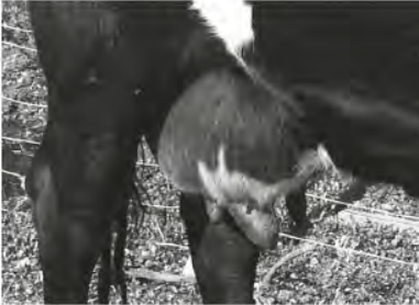
The affected quarter is swollen, hard, painful and hot, with a grossly enlarged teat.

The affected quarter is swollen, hard, painful and hot, with a grossly enlarged teat. The udder secretion is thick and clotted (like grains of rice) with foul-smelling green/yellow pus. Affected animals may abort and may die if prompt treatment is not administered. Even after prompt treatment, the