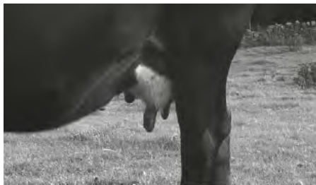
Fly control measures (usually synthetic pyrethroids) include methods such as impregnated fly tags, pour-on preparations and sprays. (Note the trauma caused to the teat by the cow repeatedly licking the teat due to irritation from flies).

Economics Loss of an affected quarter reduces future milk production by around 10 per cent and affected cows command poor sale prices. Convalescence is extended and cattle may lose 50-100 kg liveweight.