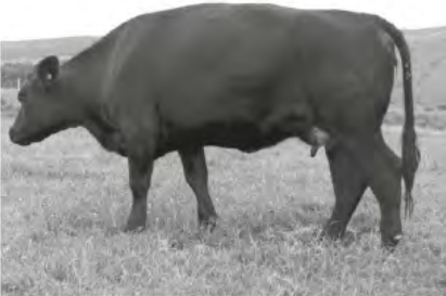
In beef cows, summer mastitis is often seen when barren spring calving cows are kept for latter breeding. Note the swollen fore teat and gland