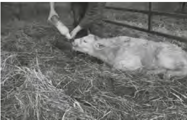
Colostrum from another cow is strongly recommended for weakly calves born to cows with severe summer mastitis.

affected quarter is permanently damaged. Illness leads to the birth of weakly calves which have a high mortality rate. Colostrum from another cow is strongly recommended for these calves.