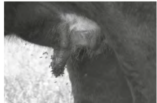
Transmission of infection is thought to be by the head fly

Bacterial causes include Arcanobacterium pyogenes , Peptostreptococcus indolicus , Streptococcus dysgalactiae which act synergistically to cause summer mastitis. Transmission of infection is thought to be by the head fly ( Hydroteia irritans ). These flies live in bushes and trees, and can only fly during mild, damp humid conditions and low wind speeds thus cases tend to be associated with "problem fields" next to woods and high hedges.