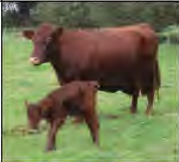
Fedw Princess, aged 24 years, with her 20th calf Fedw Dawn

JOIN THE OTHER 24 RED POLL HERDS CURRENTLY ENJOYING THE BENEFITS OF SEQUIM