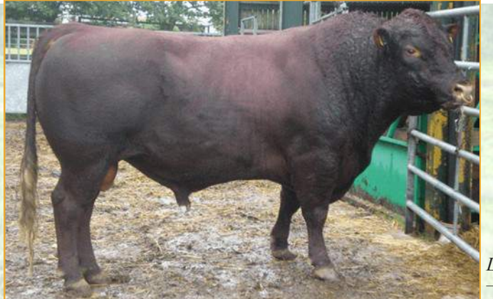
Lavenham Sir Galahad from suckler herd