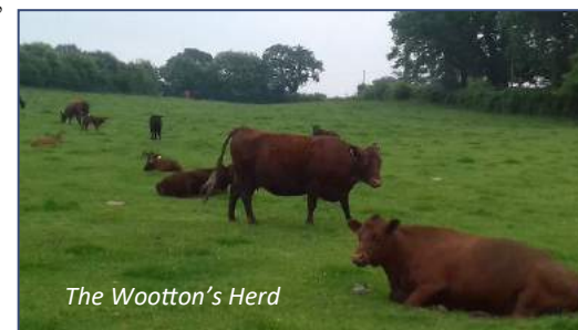
The Wootton's Herd