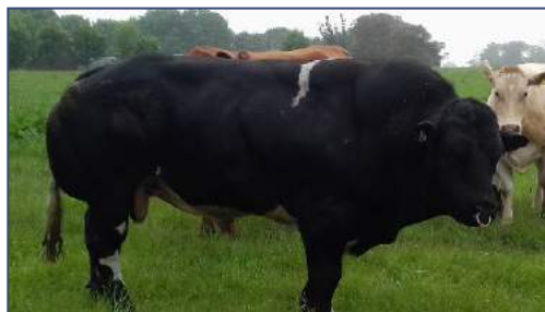
Belgian Blue Bull

calves accordingly. Billy is concerned about the lack of milk and calving issues that these cows are having hence the move towards the Red Polls. He now has over 60 cows. He is mating the majority of them with Belgium Blue bulls, the Red Poll bull being used on a few to produce Red Poll replacements. The first crop of Blue cross calves were about three weeks old and I have to say looked very impressive calves, all black with a touch of grey roan in some of them. All male calves are kept entire and sold as bull beef, heifers being either kept as replacements or finished for beef. The Blonde cattle are mainly pure bred and are kept to produce high quality breeding bulls which find a ready market to pedigree and commercial breeders alike. Quite a lot of showing is also carried out. Billy showed me his team for the forthcoming Royal Highland Show, they were certainly impressive cattle. He also showed me his recently purchased Blue bull, what a beast he is, certainly a far cry from the Red Polls. It will be interesting to see how things develop in the future. They are tenants of about 600 acres of the Wemyss Estate, mainly grassland but also about 200 acres of arable. After a meal in the local restaurant I went to the local Station Hotel in preparation for my early Monday morning return back to Chelmsford.