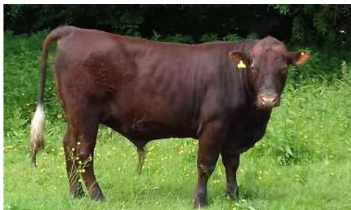
Levalsa Jacky's Boy